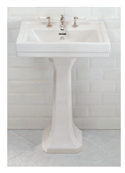
METROPOLE New York 1932 PAGE 22