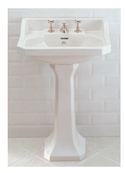
CHARTER HOUSE England 1918 PAGE 9