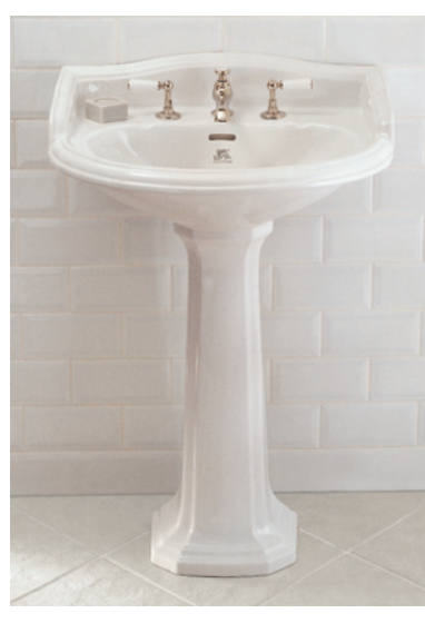
Scotland 1870 PAGE 4