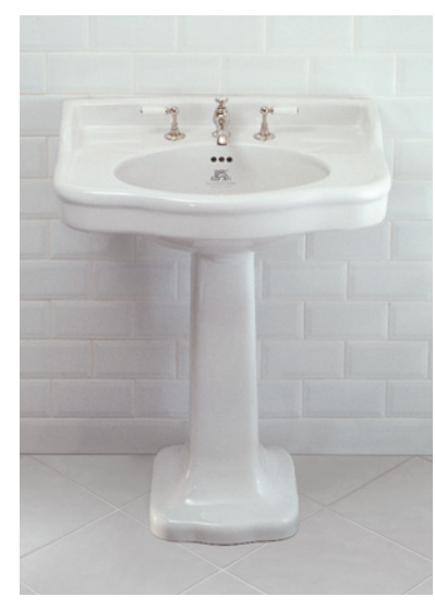
LA CHAPELLE Paris 1902 PAGE 14